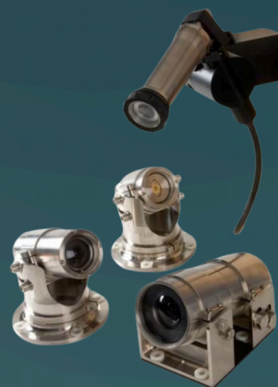
High performance, fleet fit, low light level submarine video cameras