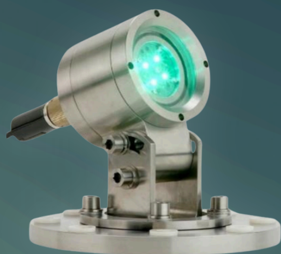
High output LED lamps